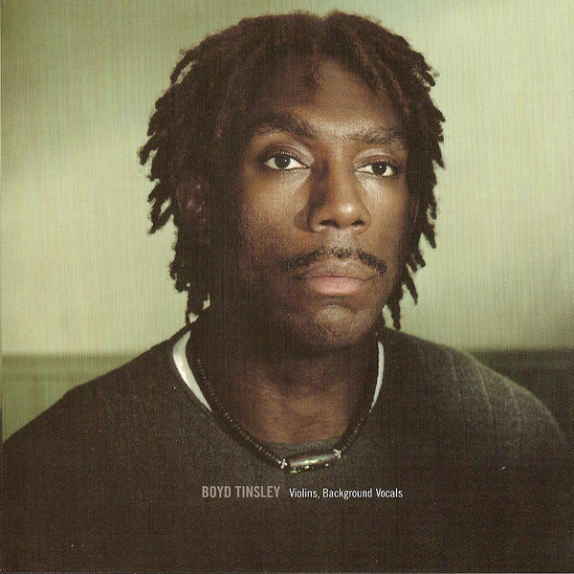
BOYD TINSLEY Violins, Background Vocals