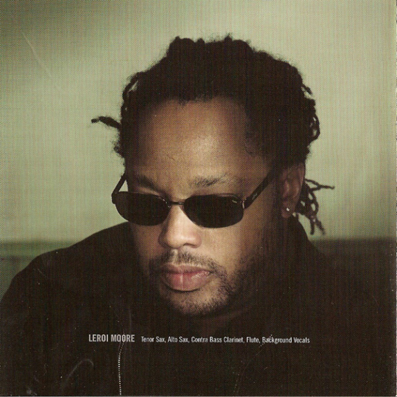
LEROI MOORE Tenor Sax, Alto Sax, Contra Bass Clarinet, Flute, Background Vocals