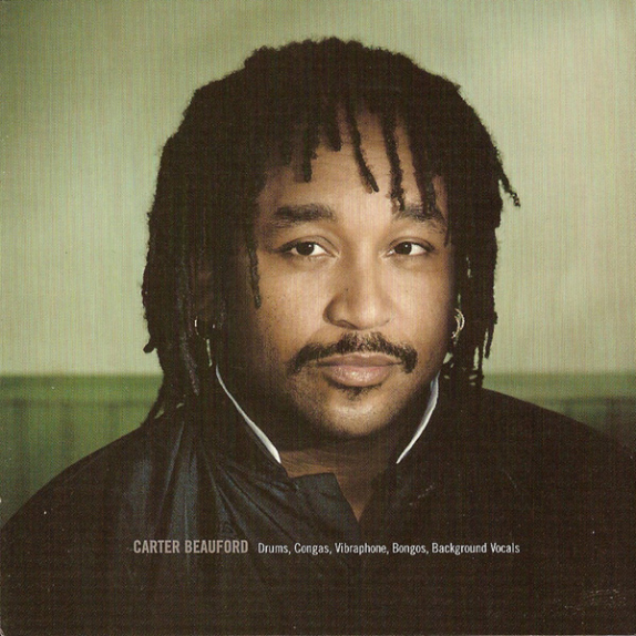
CARTER BEAUFORD Drums, Congas, Vibraphone, Bongos, Background Vocals