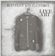
Live Art (2/4-46247)

A fter Howard left in 1992, we played as a trio for a couple of years. Then we started integrating friends as guests on particular tours. Sam Bush and I had played together for nine years in New Grass Revival. Paul McCandless was a new friend who sat in on the Tales From The Acoustic Planet album. This tune was written during sound checks in Korea, on a tour of the Far East. We debuted it a few days later at the Tower Records in Singapore.