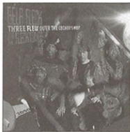
Three Flew Over The Cuckoo's Nest (2-45328)