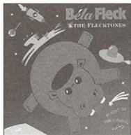
Flight Of The Cosmic Hippo (2-26562)